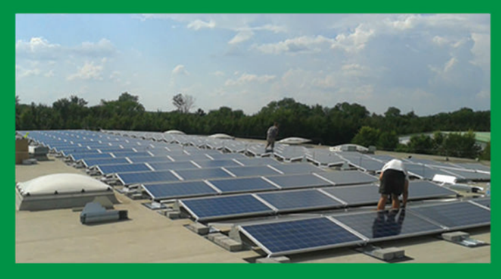
Százhalombatta, Hungary 2020 200 kW