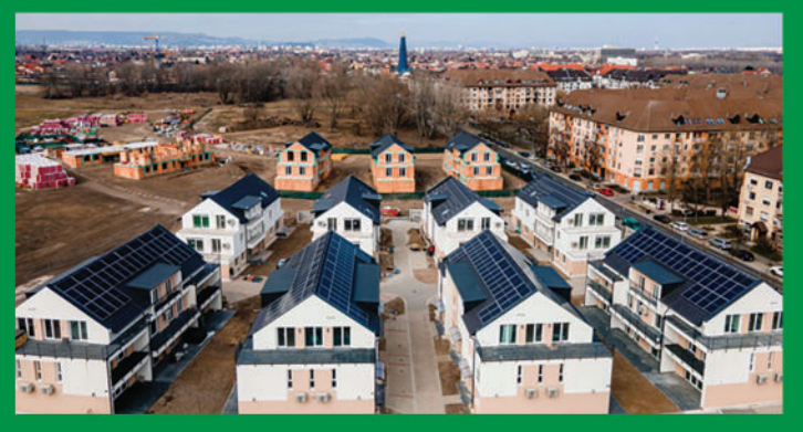
Kertvárosi Lakópark, Hungary 2023 450 kW