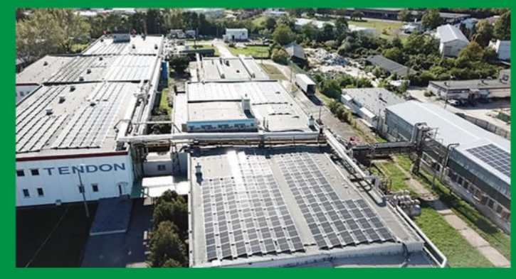
Gyöngyös, Hungary 2022 490 kW