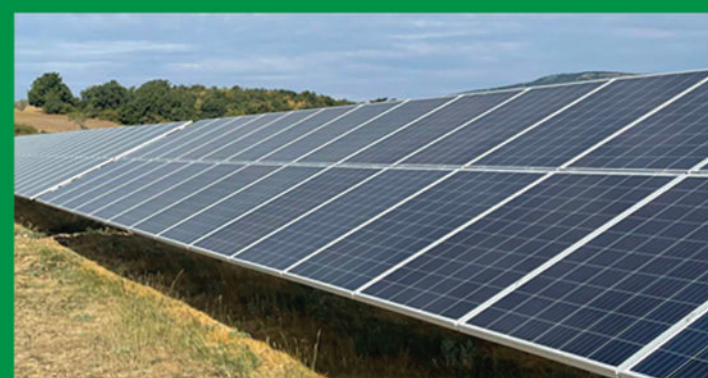
Öskü, Hungary 2020 10 MW