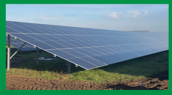
Somogy vármegye, Hungary 2022 77 /41 MW