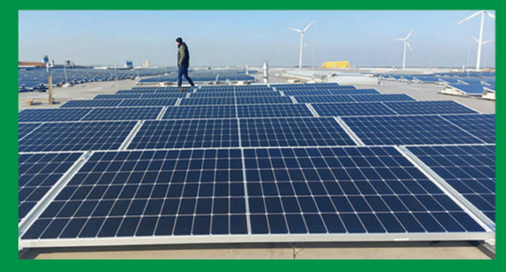
Kosice, Slovakia 2022 500 kW